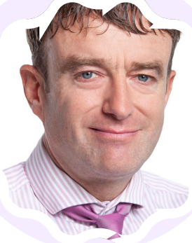
DEPUTY HEAD OF PRIMARY

It has been a wonderful start to this academic year. The new children have settled well and are already focused to progress their learning. Our returning children have acted like role models to support our new pupils when learning school routines, behaving well and using manners to communicate. This term, it has been great to see many parents on campus attending the Coffee Mornings. Please remember that we are always here to help, so please don't hesitate to ask. I wish you all a lovely holiday once it arrives.