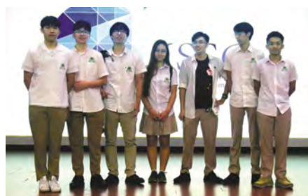
ABCIS Team 1