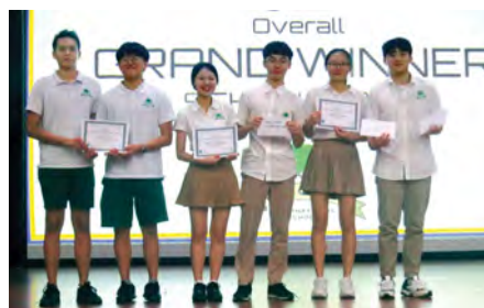
ABCIS Team 2